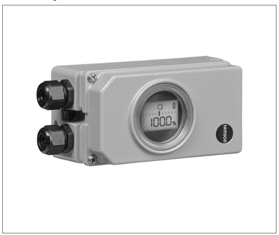
Type 3730-4 Electropneumatic Positioner