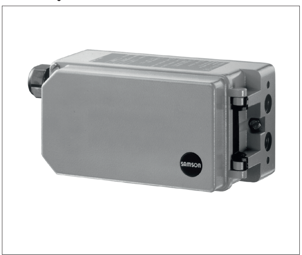
Type 3730-0 Electropneumatic Positioner